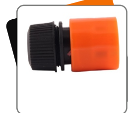
SUCTION PIPE ADAPTOR