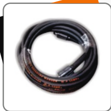
6 MTR/11MM STEEL HOSE PIPE