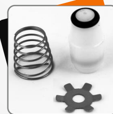
PRESSURE RETAINING VALVE