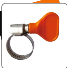
HOSE PIPE CLAMP