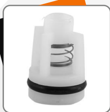
CHECKING VALVE OUTLET