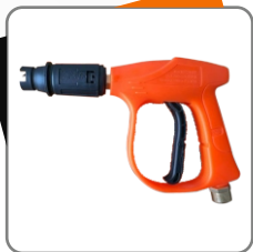
HEAVY DUTY GUN