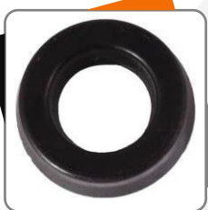
PISTON OIL SEAL