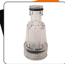
TRANSPARENT INLET FILTER