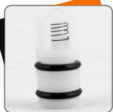
CHECKING VALVE INLET