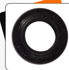
WATER SEAL 12X20X5.3