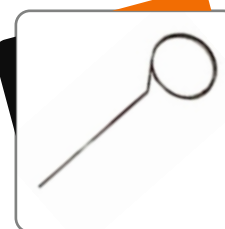
GUN CLEANING PIN