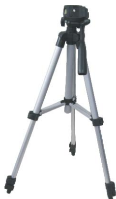
Stand for Tripod Mounting