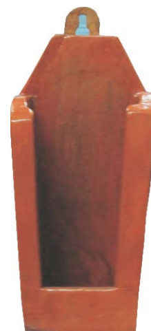
Stand for Wall Mounting